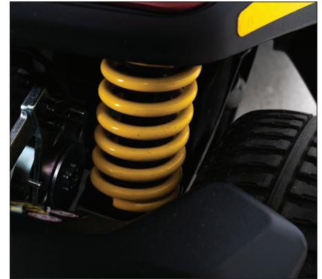
CTS Suspension on front and rear