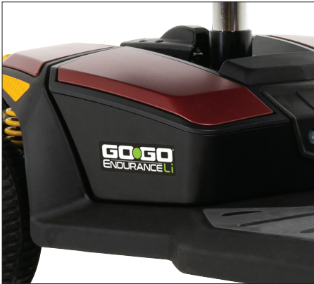
Long-lasting, lithium-ion battery