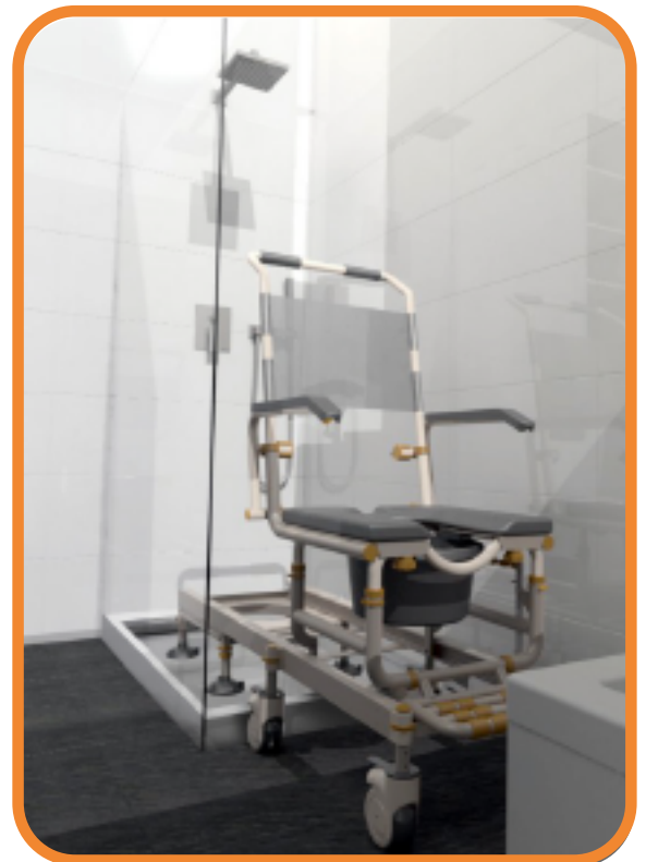
SB1 transfers into a standard shower that is not accessible