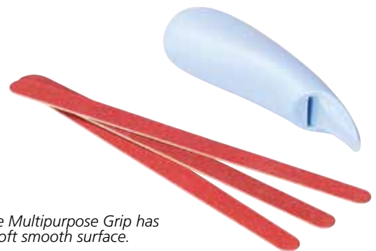
The Multipurpose Grip has a soft smooth surface.

Beauty Multipurpose grip rests securely in the whole hand and offers a variety of use. With a poor hand function it can be very difficult to use a nail file. By inserting a nail file into the narrow end, a pedicure can be done with ease. The wider end of the grip may be used for a tooth brush or shaver.