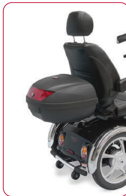
Rear storage pod