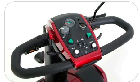
Easy-drive tiller with wraparound handles