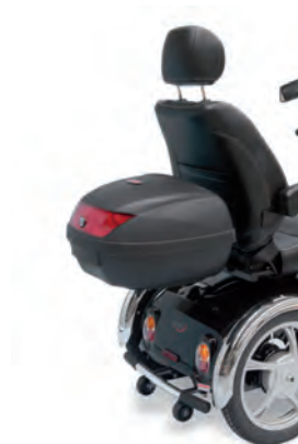
Sport rider with rear pod

The information contained herein is correct at the time of publication; due to the manufacturer's commitment to constant improvement and development, they reserve the right to alter specifications without prior notice.