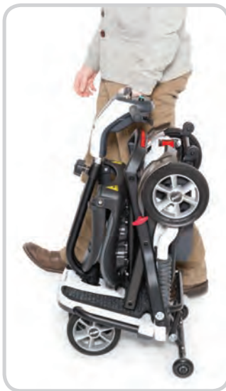
Easy to Transport