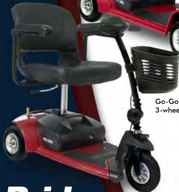
Go-Go ® Ultra X 3-wheel