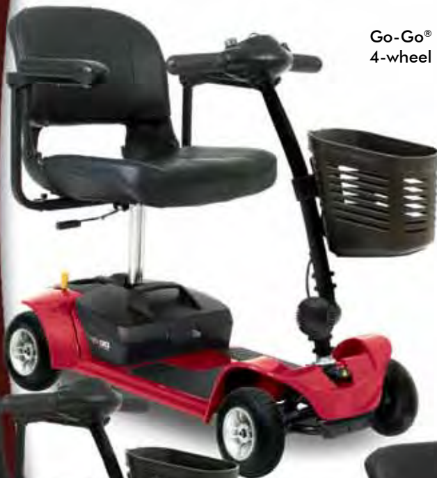
Go-Go ® Ultra X 4-wheel

The Go-Go Elite Traveller ® Plus was designed to bring travel scooters to a greater range of people than ever before. An increase in length and width, and a weight capacity of 147 kg (325 lbs.) combine with a wraparound easy-drive tiller to allow both the larger individual and those with limited dexterity to experience the benefits of a travel-specific mobility product for the first time. Featuring seat post suspension for a smoother ride and one-hand feather-touch disassembly make the Go-Go Elite Traveller Plus the easiest travel scooter to take along anywhere.