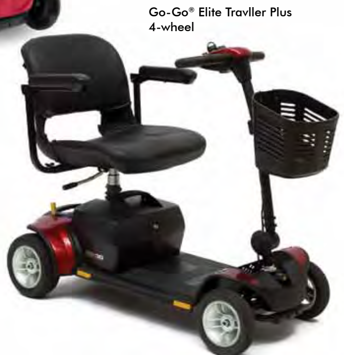
Go-Go ® Elite Traveller Plus 4-wheel